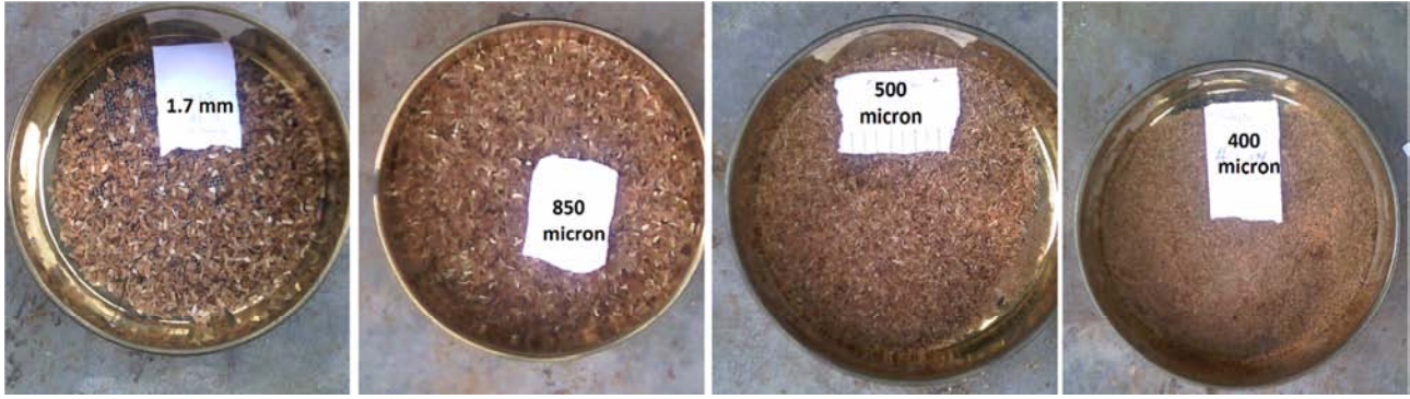
Figure 3. Sample material retained on each sieve.

Cumulative percent of material retained in the n^{th} sieve