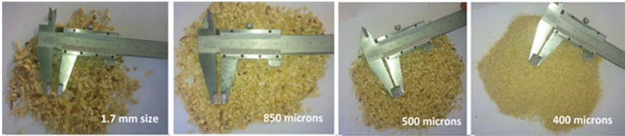
Figure 4. Measure of sample sizes retained on each sieve.

Sieve shaker (Fritsch®) was equally used to determine the geometric mean particle sizes. The geometric mean diameter of feedstock was determined using ASAE Standard S319.4 test procedure [16].