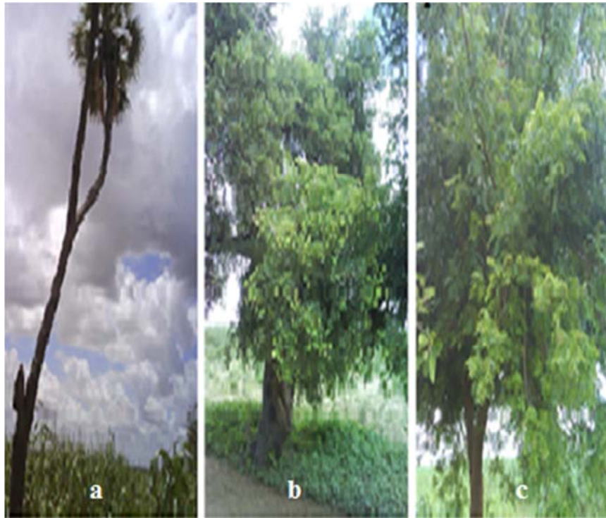
Figure 1. Examples of some forest trees in Fadama/Dryland areas: (a) Ziziphus spp (Magarya), (b) Adansonia digitata (Kuka), (c) Acacia nilotica (Bagaruwa).