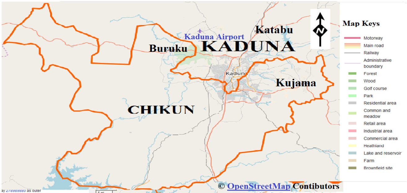
Figure 1. Map of Kaduna State Showing Chikun Local Government Area (Open Street Map Foundation, 2013).

35°C at the end of the dry season. The area is drained by a network of rivers (Figure 2), the drainage pattern is dendritic and the streams are all subject to seasonal water level fluctuations [7-9]. The location of Dams, river and streams in Chikun Local Government Area encourages fishing, irrigation farming, block making, spiritual activities, and swimming. Most of the people prefer washing and bathing in the river after a long day work of farming, fishing, rock breaking and block making.